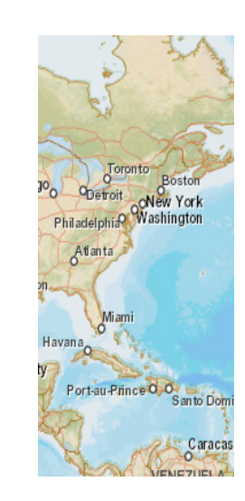
You are in NAVIGATE Mode (Move Map, Zoom) Click to switch to SELECT Mode