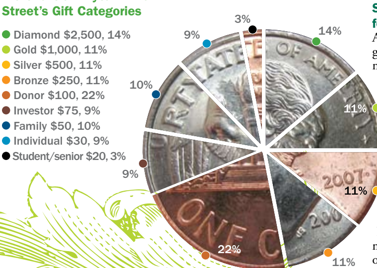
CHART III Pie Chart of Anytown Main Street's Gift Categories